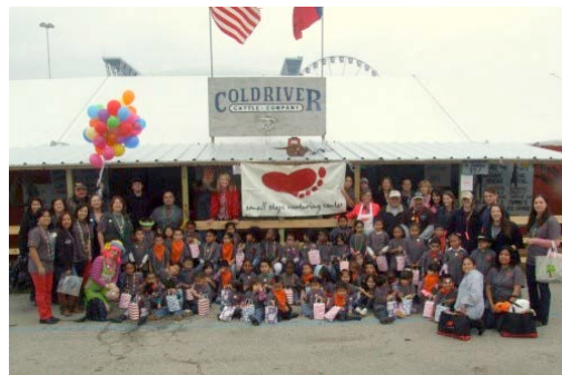
Small Steps Kids

Pictures say a million words, but your donation will help many.